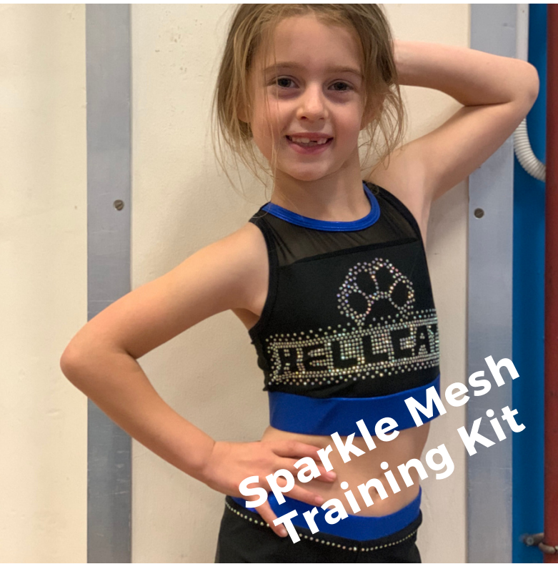
Sparkle Mesh Training Kit